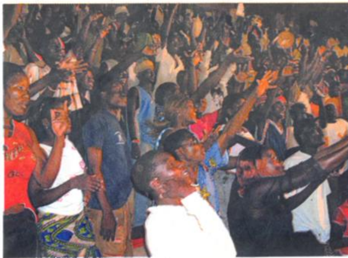
• Les invités